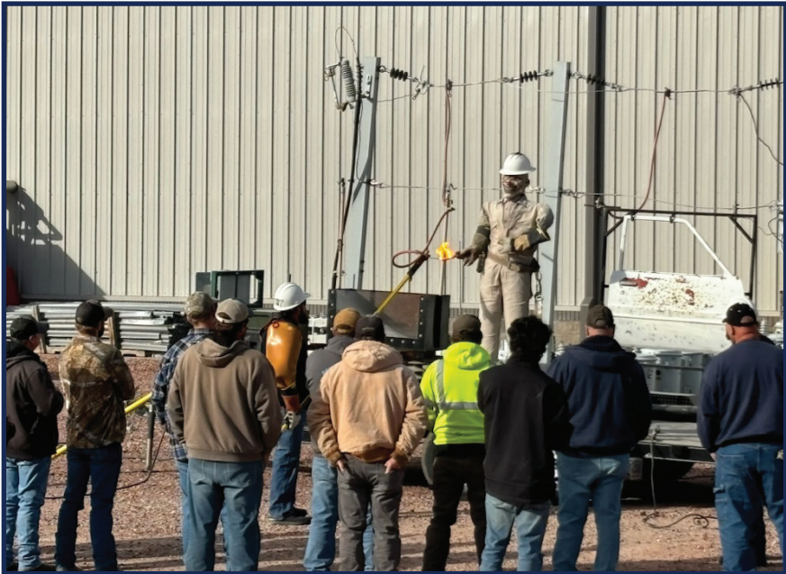
Following the cooperative principle of "Concern for Community", Wyrulec crew members provided safety training to employees of the Goshen Irrigation District last month.